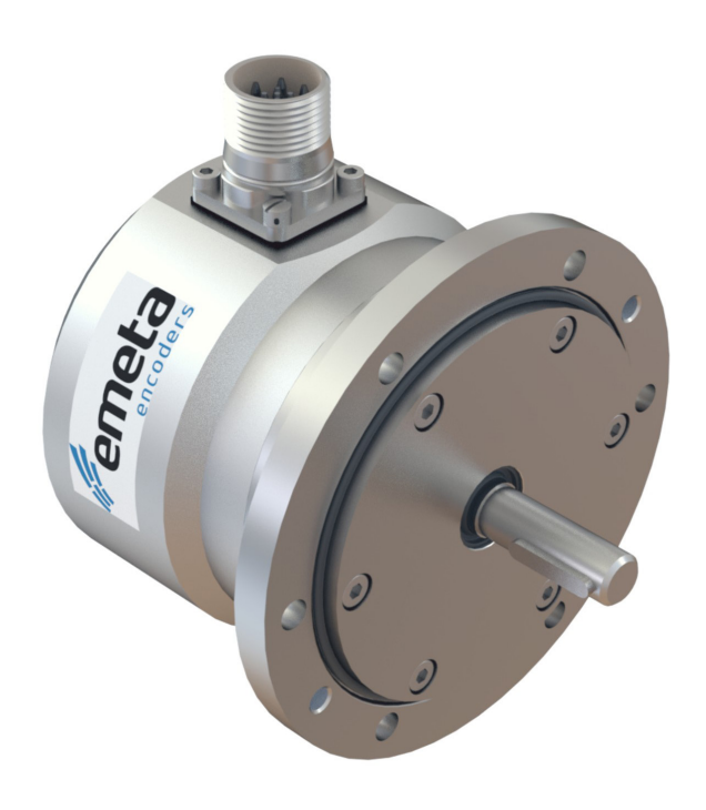
MA4301 with 12pin M23 Male Connector