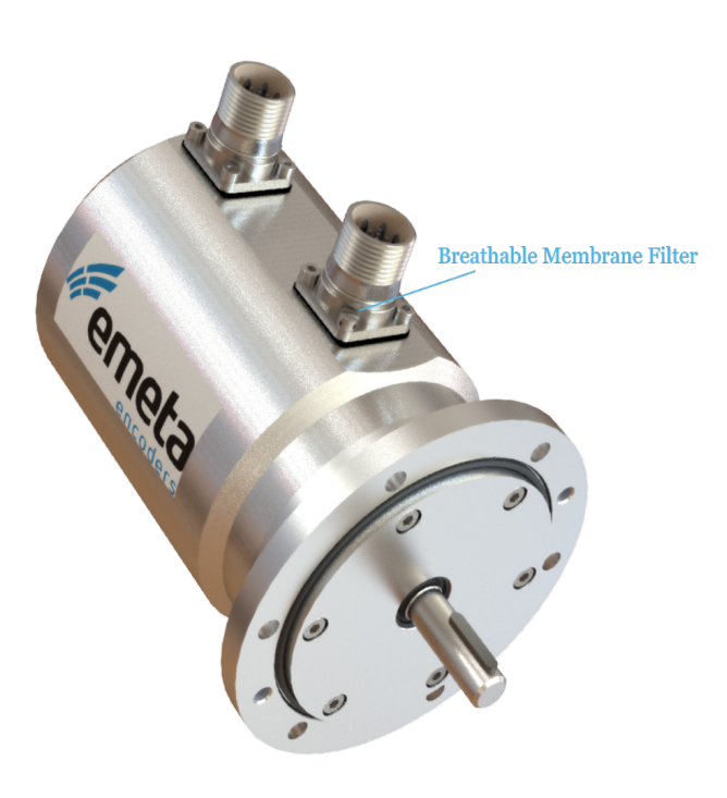
MA4201 with 12-pin M23 Male Connector